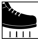
Product features reinforced midsole