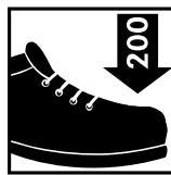
Product features 200J toe cap