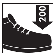
Product features 200J toe cap