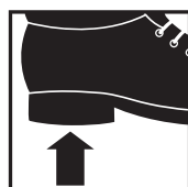
Product features energy absorbing heel