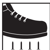
Product features reinforced midsole