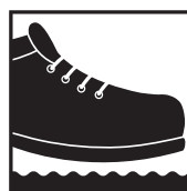
Product features anti-slip sole