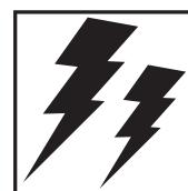
Product features antistatic sole

The information shown on this specification sheet is intended as a guide and is advisory only. All details were correct at the time of issue. As conditions of use are ultimately beyond our control, we advise that the product is tested for the particular application before use.