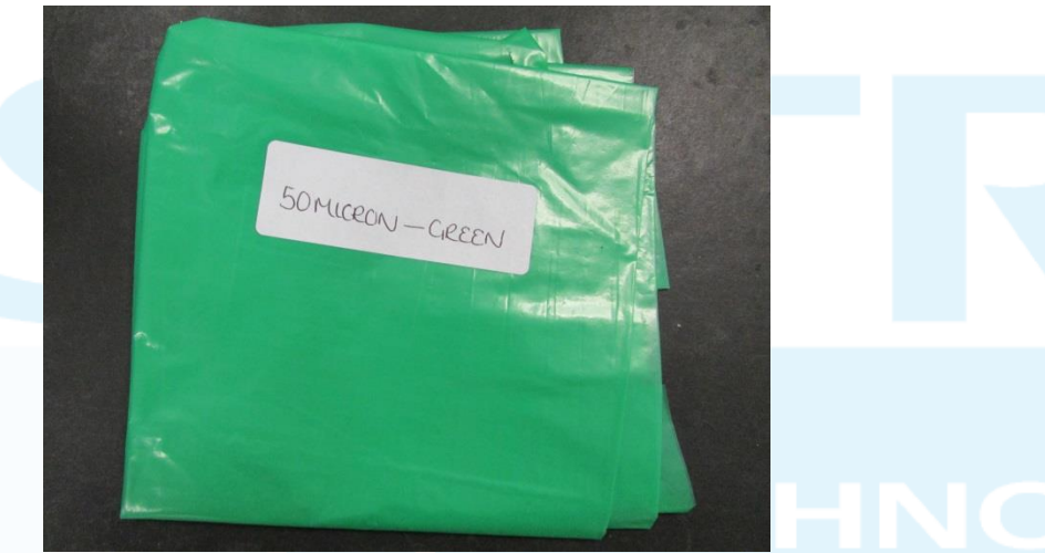
Samples described as PE material-green