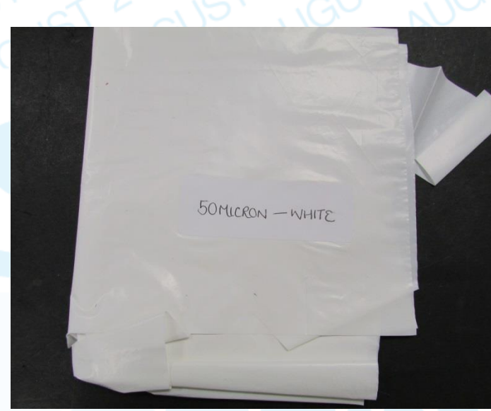
Samples described as PE material-white