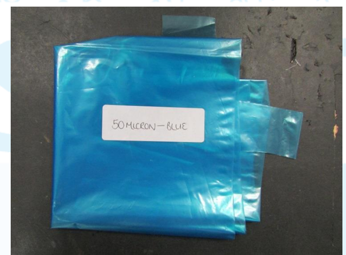
Samples described as PE material-blue