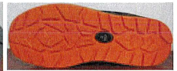
BCG50 Safety Trainer Black/Orange SFW-20280-B