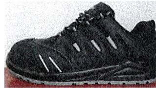
BCG50 Safety Trainer Black SFW-20270-B