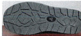
BCG50 Safety Trainer Black SFW-20270-B