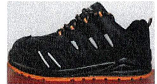
BCG50 Safety Trainer Black/Orange SFW-20280-B