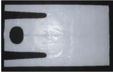
Samples described as White 50 Micron Apron