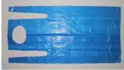
Samples described as Blue 50 Micron Apron