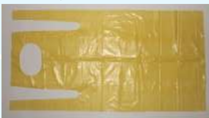
Samples described as Yellow 50 Micron Apron