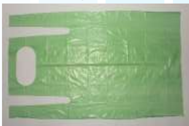
Samples described as Green 50 Micron Apron