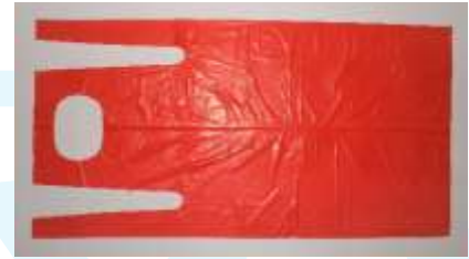
Samples described as Red 50 Micron Apron