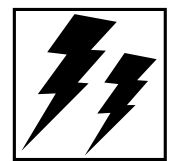
Product features antistatic sole