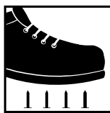
Product features reinforced midsole